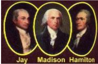
Federalists Papers – A series of papers that explain and support the Constitution